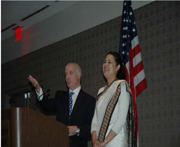
Business breakfast for DFW Corporate Executives jointly organized by GDIACC & World Affairs Council